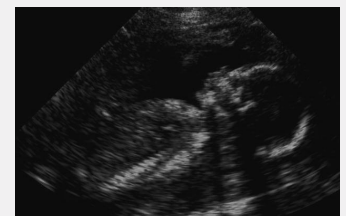
Fetus - Head, Abdomen, Backbone