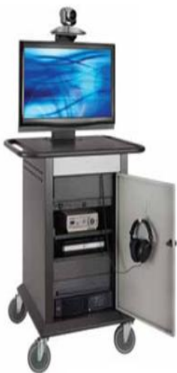
On a mobile cart are AMD-400 Camera and Illumination and scopes.

Since the program's inception, TTUHSC's Telemedicine consultations have steadily increased and its number of telemedicine sites has dramatically grown. Today, the TTUHSC telemedicine program has grown to support a broad range of services in rural areas, correctional institutions, and assisted living communities and now consists of three core areas- Community Telemedicine, Correctional Telemedicine and Telepharmacy.