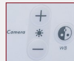
One-Touch White Balance and Camera Brightness Controls