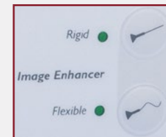
Image Enhancer for Flexible & Rigid Scopes