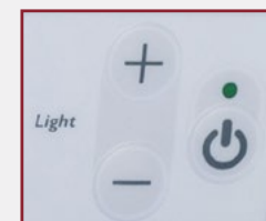
Optimal Light Intensity Controls