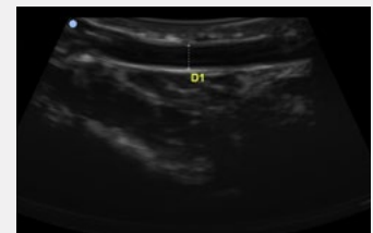
Radial Artery – Longitudinal

AMD Global Telemedicine 321 Billerica Road Chelmsford, MA 01824